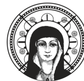
St. Clare Church ROSEDALE, NEW YORK EST. 1924