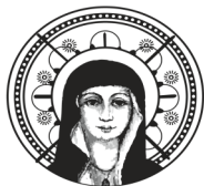
St. Clare Church ROSEDALE, NEW YORK EST. 1924

ST. CLARE CATHOLIC CHURCH 137-35 Brookville Boulevard Rosedale NY 11422 718-341-1018